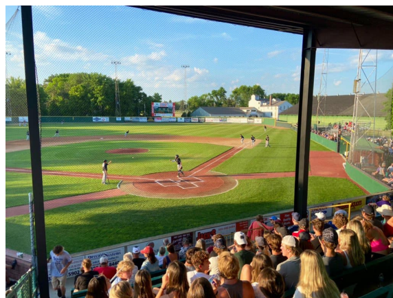
The SWC Stars and GSL Panthers warm up while a large crowd watches on.

Tonight, the Section 5AA playoffs continue as the Lakers and Panther square off in an elimination game. First pitch is slotted for 7:00pm, so come on out and enjoy some exciting playoff baseball!