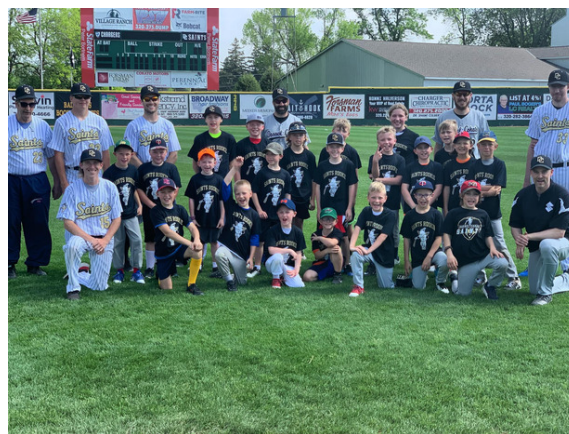
Thank you Rookie Leaguers and parents for participating in Saints Rookie League for 2021!

Reminder: Tomorrow is "Rookie League Night" at our game against the Buffalo Bulldogs. An email was sent out yesterday morning to parents of Rookie Leaguers. If you did not receive it, or need more information, please email us at info@dcsaints.com .