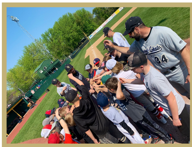
The Rookie Leaguers break it down on "SAINTS!" after another fun morning!

Reminder: Next week is the last Saturday morning session (9:00am-10:30am). We will have Rookie League shirts available, which the kids will be able to wear for "Rookie League Night", Wednesday, May 26th when we take on Buffalo.