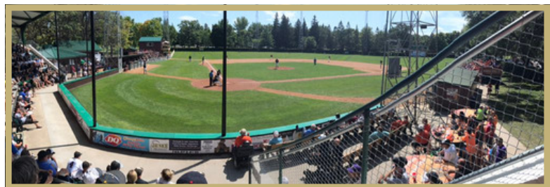
Optimist Park - Litchfield

Home of the Delano Athletics, Delano Tigers, and various summer teams in Delano.